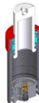
MP1000-050-A-W Add "-W" to standard code